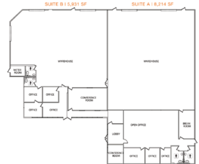
CURRENT FLOOR PLAN